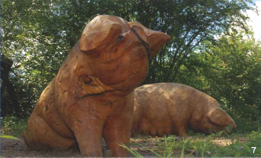
"For men may come and men may go, but I go on for ever"