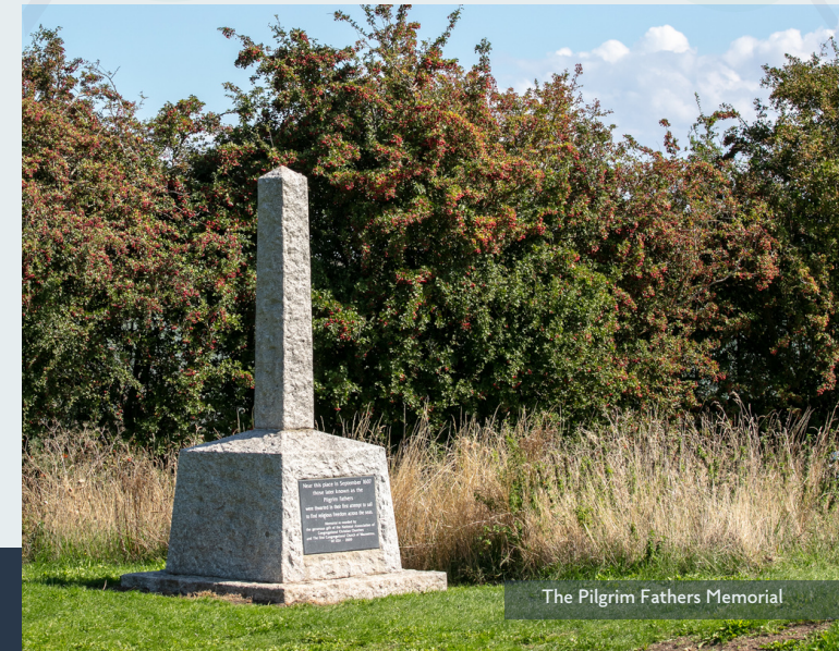
The Pilgrim Fathers Memorial

Explore and discover Boston's stunning green spaces