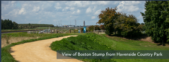
View of Boston Stump from Havenside Country Park

Havenside Country Park is a stunning riverside park overlooking The Haven, leading out to sea at The Wash. The park's location makes it a perfect spot for a peaceful walk, away from the hustle and bustle of the town centre. With open skies and views of the Stump, it's definitely a place not to miss. At high tide, you will often be able to watch ocean-going ships coming in or out of the Port of Boston.