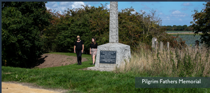
Pilgrim Fathers Memorial

The jewel in the park's crown is the Pilgrim Father's Memorial which commemorates the Pilgrim Fathers' attempts at religious freedom. Steeped in local history, it's a must-see for anyone interested in discovering Boston's rich history and cultural ties.