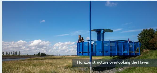
Horizon structure overlooking the Haven

The country park is also home to 'Horizon', an engaging structure built as part of a series of installations along the Lincolnshire coast known as 'Structures on the Edge' which promote developing artwork and coastal architecture. Horizon explores themes of nautical navigation by allowing visitors to imagine journeys into the unknown and beyond the horizon, as the Pilgrim Fathers once did.